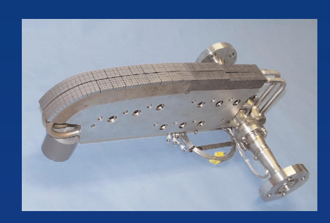
CfC monoblock and W brush armoured vertical target (EU).