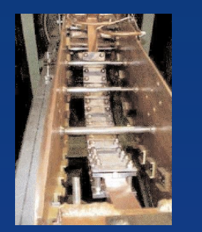
W and Be armour fast brazing to liner CuCrZr heat sink (RF).